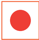
Made in Japan