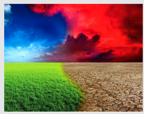
Expanding 3 CMYK/RGB and PosterColor 2.0

New hue stabilization and color engine enhancements provide high saturation levels and large output gamut size with existing calibration and ink settings while maintaining image detail in shadow areas