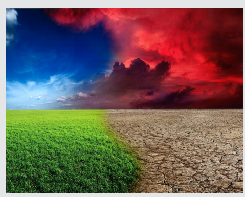
Default ICC settings