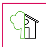
Outdoor / Indoor