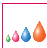
Piezo Variable Drop