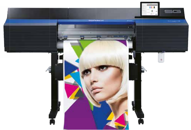
SG-300 (762 mm wide)