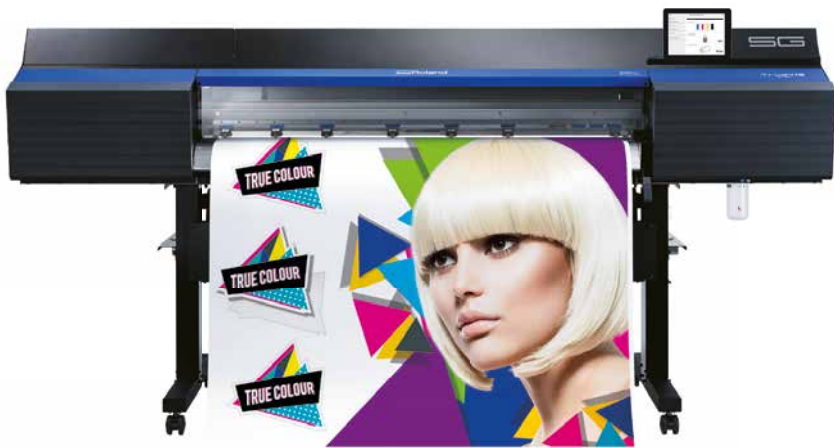
SG-540 (1,371 mm wide)